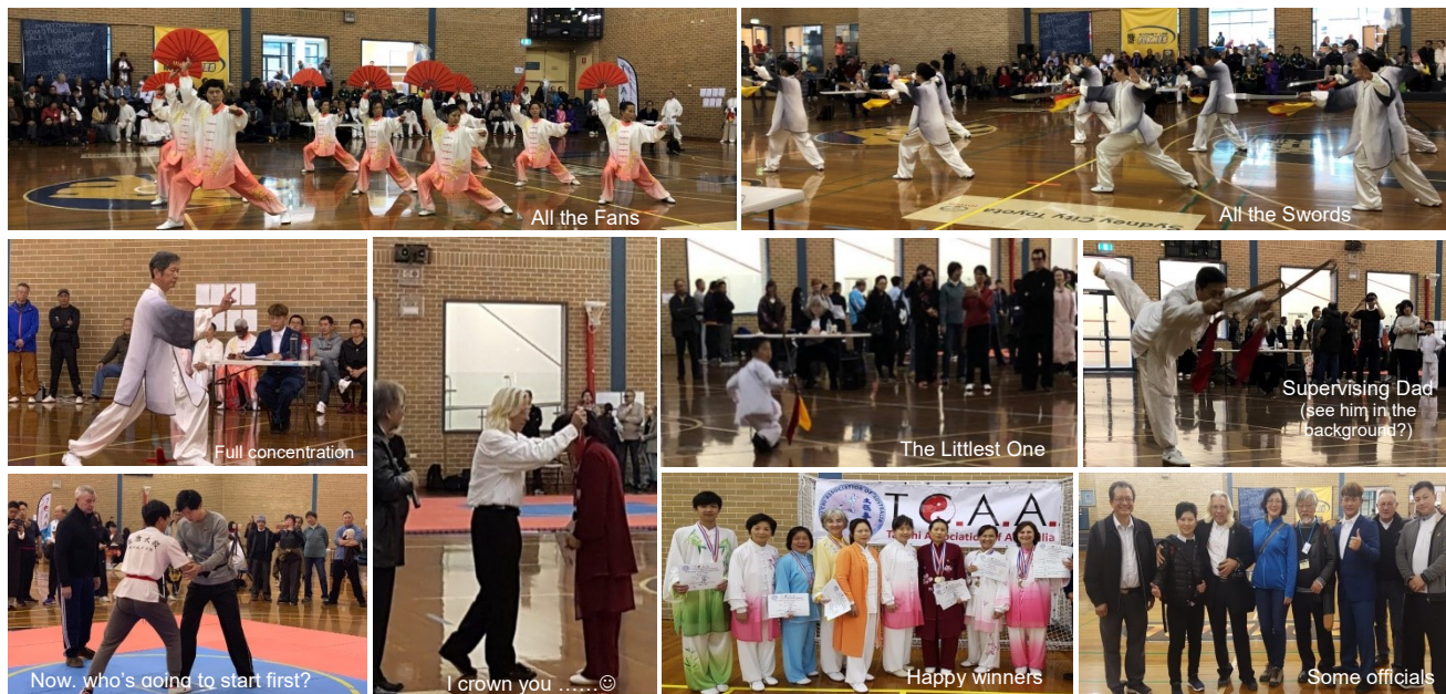
All the Fans