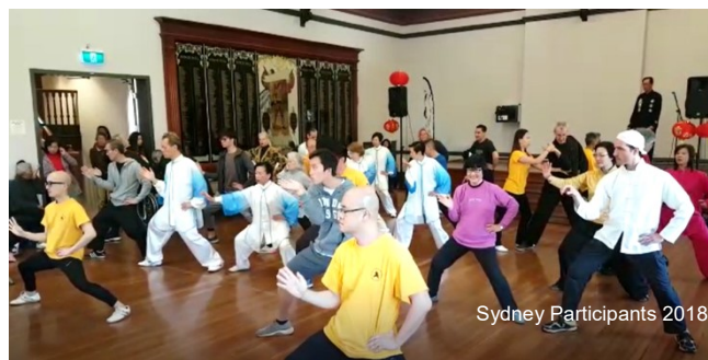
Sydney Participants 2018

Other States? Please contact your State Rep, or organize something yourself with your class and invite the public.