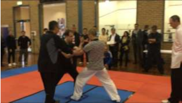
Push Hands, 61-70 kg –Male

More pictures of the 2016 TCAA Competition: