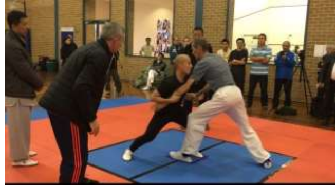
Push Hands, 51-60 kg –Male