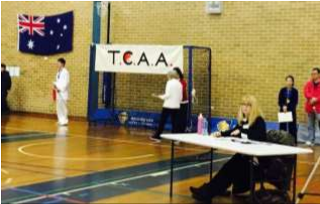
Competitors getting ready. One of the judges.